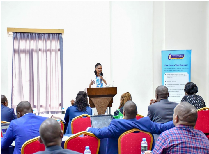
Registrar of Political Parties address stakeholders who attended the forum on 15th November 2022 in Machakos.

The Registrar while speaking at the start of the forum, appreciated stakeholders for their support and collaboration, a positive factor in the realization of ORPP's successes in the last general election. "This election evaluation exercise will help us identify the gaps and the possible areas of linkages and improvement going forward", said the Registrar while highlighting the raft of reforms undertaken.