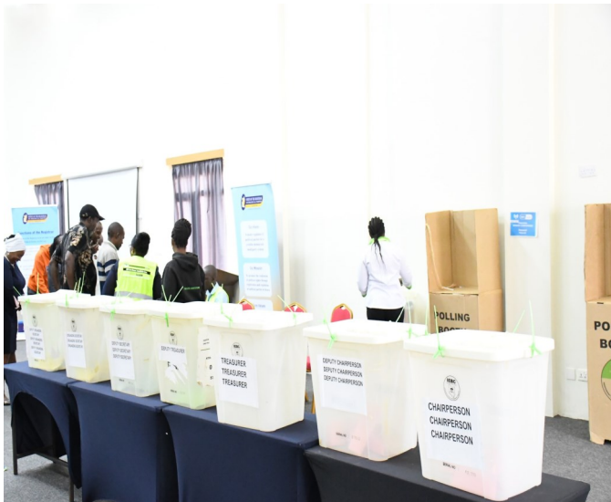
Preparation for elections of National Steering Committee of Kenya on 8th November 2022 at Machakos county.