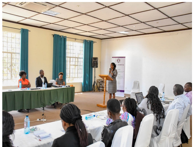
Registrar address Special Interest Group (SIGs) held on 2nd December, 2022 in Nairobi.