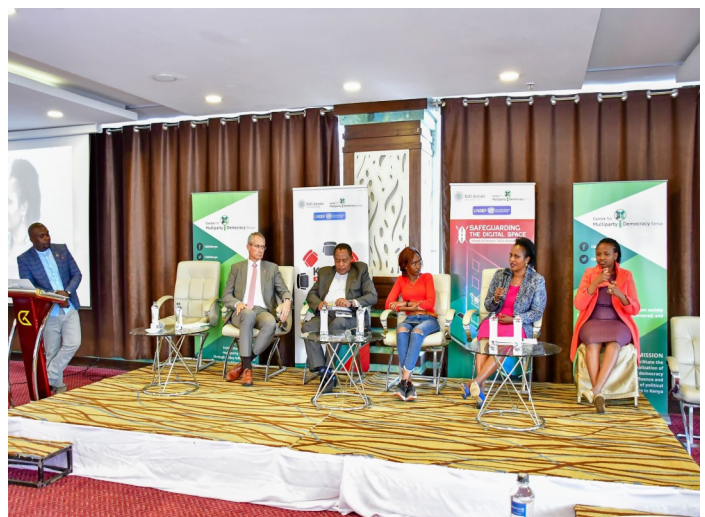
Registrar speaking during a panelist discussion on 11th November 2022 in Nairobi

Time is rife to uphold National Values and Principles of good governance in politics. In her keynote address during a multi-agency election review meeting on 10th and 11th November 2022 in Nairobi the Registrar of Political Parties, Ann Nderitu called for the citizenry's positive behavior change as a way of the ways of reforming the country's political sphere. "We must collectively curb electoral malpractices to restore political decency", said the Registrar and highlighted ORPP's milestones in the last elections including legal and ICT reforms, election monitoring among others.