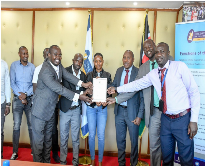
The We Alliance Party (TWAP) receive certificate of provisional registration on 2nd December 2022 at ORPP's boardroom 4th floor headquarters.