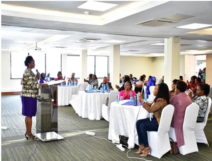
Registrar gives her speech during post 2022 general election reflection for women in leadership forum on 10th November at Jacaranda hotels, Westlands.

A post-2022 general election reflection forum for women in political leadership was held in Nairobi on 10th November 2022. ORPP was deliberate in identifying bottlenecks and championing the necessary support to enhance the participation and inclusion of women in politics.