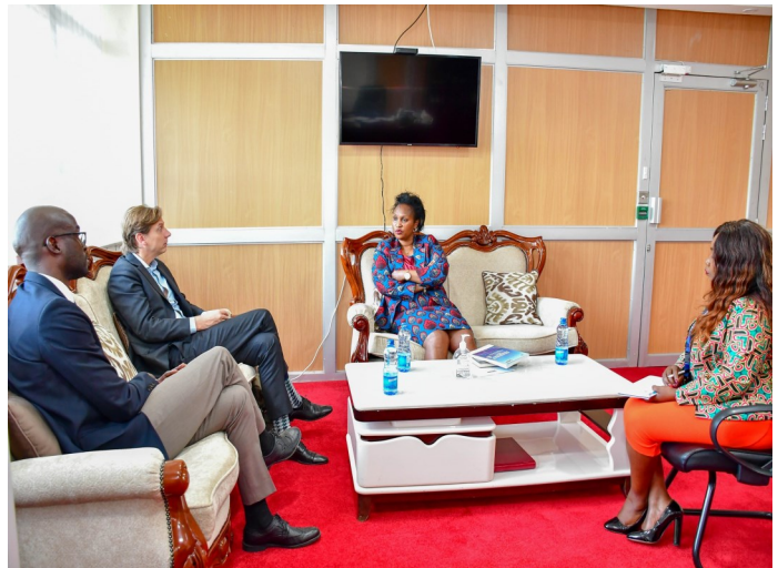
Officials of the Netherlands Institute for Multiparty Democracy (NIMD) at the Office of the Registrar of Political Parties on 9th November 2022

N etherlands Institute for Multiparty Democracy (NIMD) paid a courtesy visit to the Registrar of political Parties at her office on 9th November 2022 on a friendly study visit.