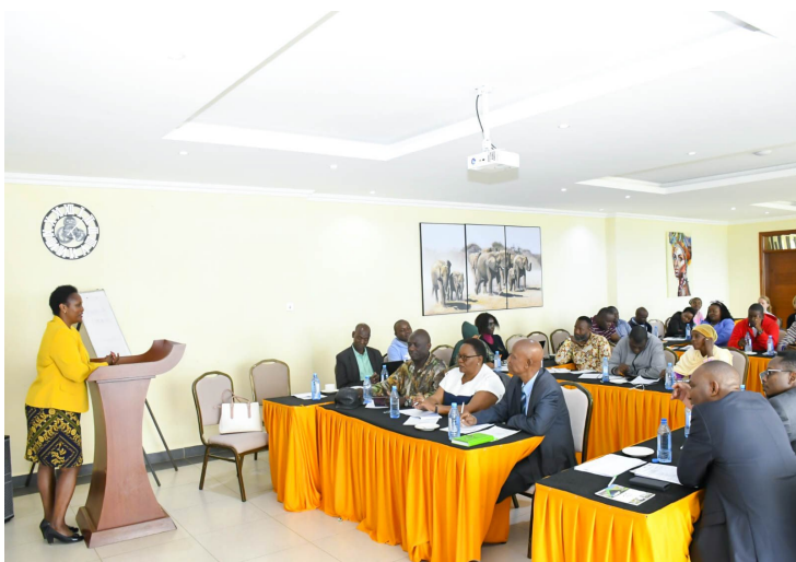
Registrar of Political Parties addressing PPLC steering committee during Political dialogue for a in Nakuru on 10th May 2023