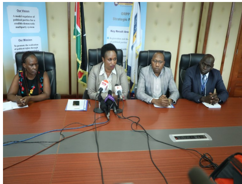
Registrar of Political Parties (second left) during a presser at ORPP boardroom headquarters on 23rd May, 2023

In a bid to put things right into perspective and counter malformation that were peddled on the subject, the Office rolled out public information messaging through the media and official platforms to inform the public on the limited role of ORPP on the matter as change officials and resolution of any dispute is within the concerned political party in line with its governance structure and constitution. The Registrar and Assistant Registrars engaged mainstream on the matter through talk shows, pressers and interviews.