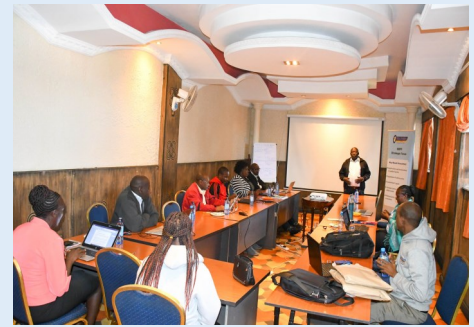
A section of ORPP team during a review meeting of Career Progression Guidelines held on 29th-31st May, 2023.

The Asst. Registrar further noted that the framework is an essential reference in Office performance management that will also help put in place other HR-bound measures such as sanctions, rewards, and career improvement plans. The HR instruments must be interlinked for seamless coordination and practices, said one of the consultants.