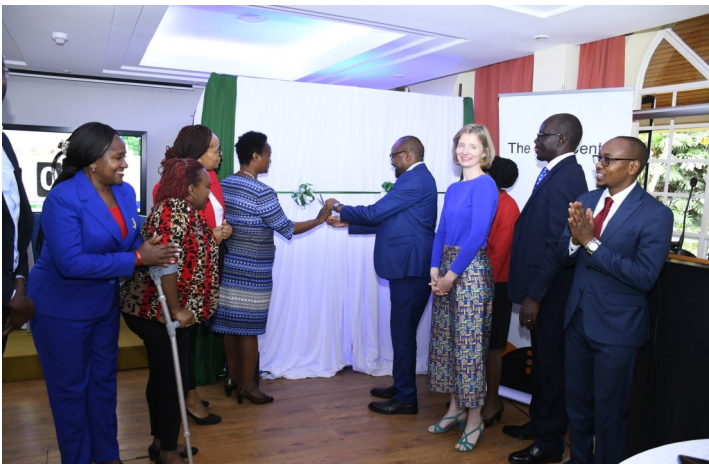
Registrar of Political parties (far left) together with officials of the Oslo Centre during the launch of “Walk the Talk” report on 3rd May in Nairobi.

The Registrar of Political Parties in her guest address, outlined the importance of SIGs inclusion in political parties' governance and the strides ORPP is taking, among them administering the Political Parties Fund and making proposals for review of legal framework pertaining political parties governance.