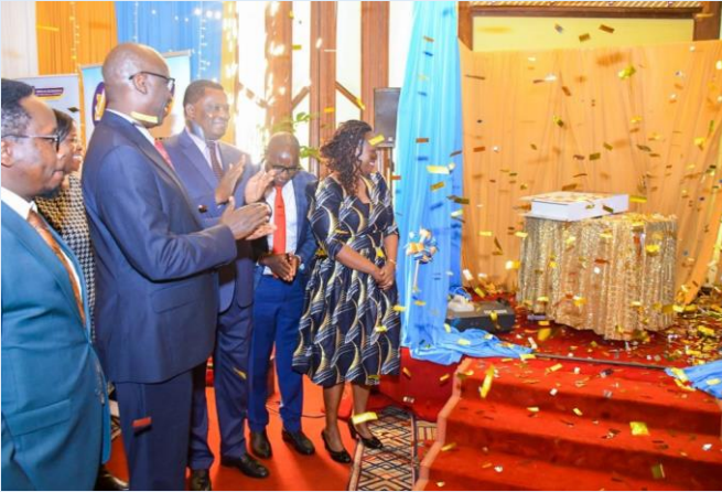
Registrar of Political Parties (far right) and Chief Guest Attorney General (third) launch Post Election Evaluation report