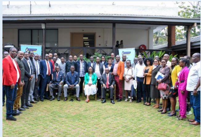
Right; Sensitization of 48 political parties that qualified for the allocation of the Political Parties Fund on the commencement of FY 2023/2024.

Produced by: Corporate Communication Unit