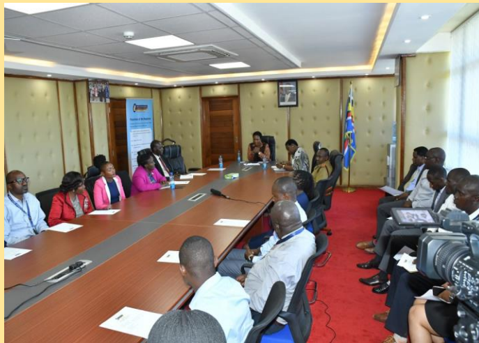
Registrar of Political Parties addresses members of staff during a last FY 2022/23 internal review staff meeting

all to pick up the remaining policy framework and finalize them to their conclusive end including the final approvals, possibly, by end of 1 st quarter as procedure requires", noted Assistant Registrar.