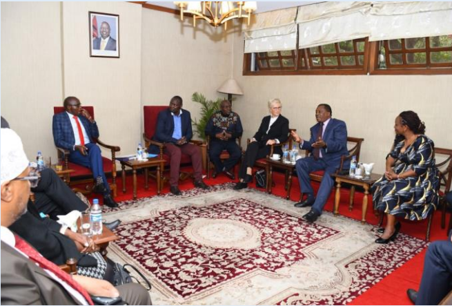
Registrar of Political Parties together with invited guests have breakfast at the VIP lounge.