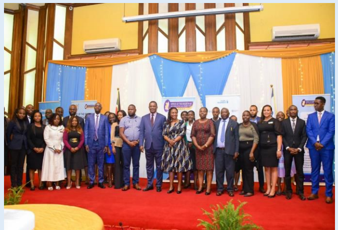
ORPP staff members pose for a group photo with Chief Guest Attorney General, Hon. Justin Muturi