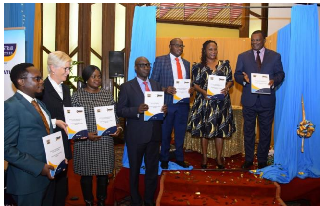
Registrar of Political Parties (second right), Chief Guest Attorney General (far right) together with invited guests launch the Post Election Evaluation report at Safari Park hotel, Nairobi on 2nd August, 2023