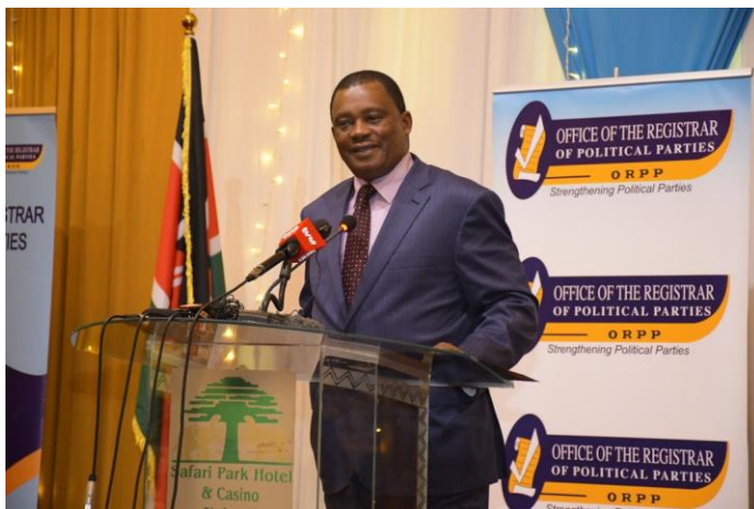
Chief Guest, Attorney General Hon. Justin Muturi speaking during the Post Election Evaluation report launch

Speaking in the well-attended spectacle event at Safari Park Hotel, Nairobi that included representatives of; political parties, state agencies, donor partners, civil and religious outfits amongst, lauded the ORPP's raft of initiatives in the run up, during and after the election stipulated in the report.