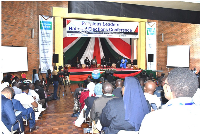
Registrar of Political Parties (third from left) speaking during the panelist discussion of Religious leaders' national election conference on 28th July 2022 at Ufangano house, Nairobi

Key topics of discussions in the forum was attended by Independent Electoral and Boundaries Commission (IEBC), Election Observation Group (KENYA), USAID Kenya, Kenya Conference of Catholic Bishops(KCCB), Independent Medico Legal Unit IMLU, Kenya National Commission on Human Rights (KNCHR) and Electoral Law and Governance Institute for Africa (ELGIA).