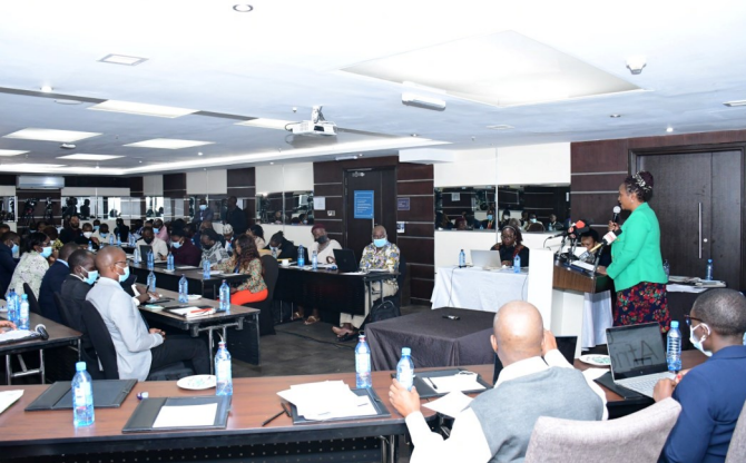
Registrar with some of the officials for African Union election observation mission on 21st July

The Registrar also informed of ORPP scheduled political parties' Chief Agents training to begin on 23rd July at national level and subsequent second level training to be conducted across clustered counties.