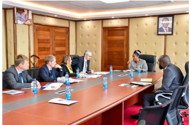
Registrar hosts officials of European Union Election Observation mission at ORPP headquarters boardroom on 15th July, 2022.

The visit by the European Union Observer Mission to ORPP and other institutions is a build-up to its mission ahead of 9th August, 2022 General election, to which it will be part of the International election observation.