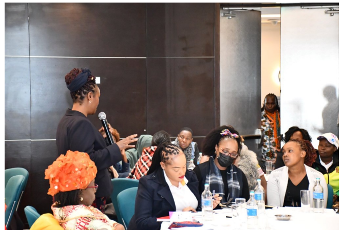
Registrar of Political Party address participants during Badili grassroots women forum at Radisson blue hotel, Nairobi

Political parties provide apt structures for women to earn, contribute and shape the country's political leadership. Speaking in Nairobi on 12th July at a Badili Grassroot Women engagement forum, Registrar of Political Parties, Ann Nderitu, outlined measures ORPP prides itself in empowering women in political parties and politics.