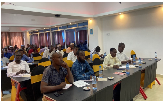
Tana River County chief party agents during the training session in Tana river on 29th July 2022

ORPP spearheaded a three day training of the political parties’ Agents in 15 clustered counties across the country from 27 th -29 th July, 2022. The training was aimed at building knowledge capacity for the Agents theoretical and practical grasp of their roles and responsibilities on the poll day.