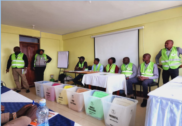
IEBC agents demonstrate process of election during the chief political party agents training in Kapenguria county