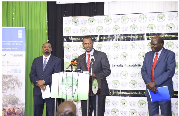
Outgoing IEBC chairman, Wafula Chebukati (right) and two commissioners

The occasion also bid farewell to the Chairperson, Wafula Chebukati, and commissioners at their end of their tenure.