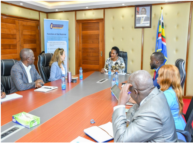
Registrar of Political Parties chairs an on-going discussion between officials of USAID, European Centre for Electoral Support (ECES) and a section of ORPP officials at the boardroom headquarters

USAID - US Agency for International Development and European Centre for Electoral Support (ECES) paid a courtesy visit to the Registrar of Political Parties. Collaborative initiatives on political education to targeted groups including Special Interest Groups, spearheading necessary legal reforms borne of the experience of the concluded August 2022 general election among other areas were discussed.