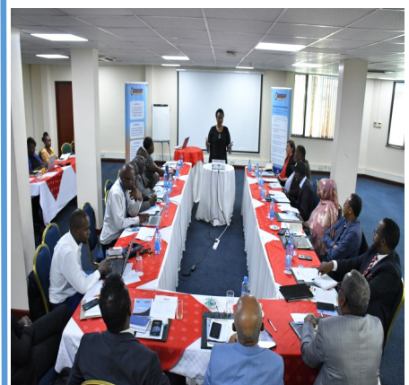
Top: Registrar of Political Party (centre) and officials of CRAANP pose for a group photo on 30 th January at ORPP headquarters.