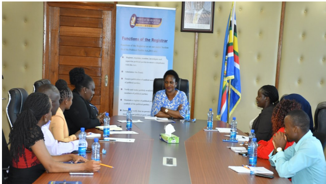
Registrar of Political Parties in a formal meeting with new staffs at 4th floor boardroom

The Office of the Registrar of Political Parties (ORPP) has recently added 7 staff members to its human capital establishment new staff members upon completion of recruitment and their reporting to duty at varied dates between December, 2022 and January, 2023. This was commenced on advertisements in public media and ORPP website of the vacancies on 8 th February 2022.