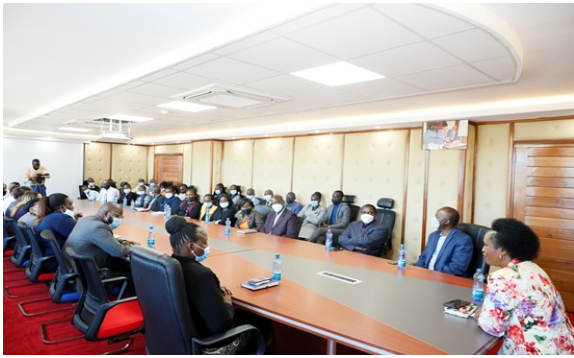
Staff members during the Office prayers at ORPP headquarters