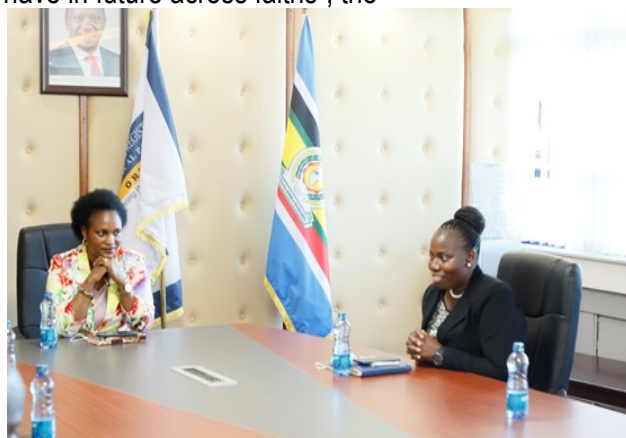
Registrar (left) and Assistant Registrar during the prayer session

"We have found it wise as Management to come together in prayers for God's guidance to this Office. Registry informed. We know we have experienced in recent past very unfortunate happenings. This is just one of a series of many of such we will have in future across faiths", the