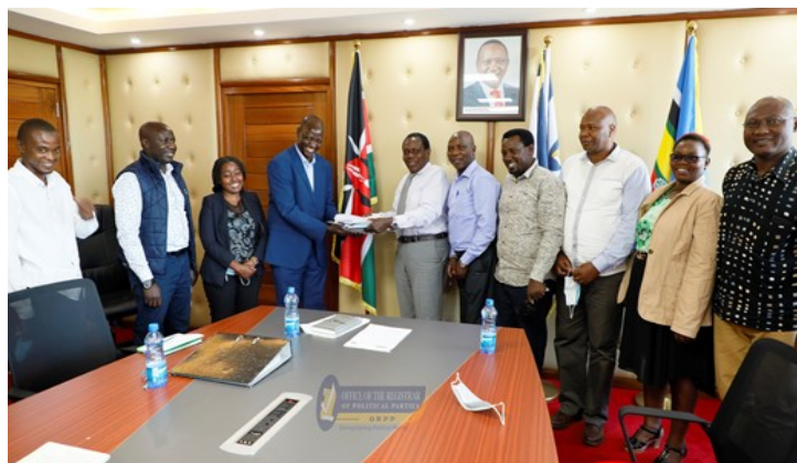
A section of Universal Unity Party officials receive full registration certificate on 14th January 2022 at ORPP headquarters