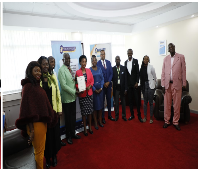
Green Thinking Action Party officials receive full registration