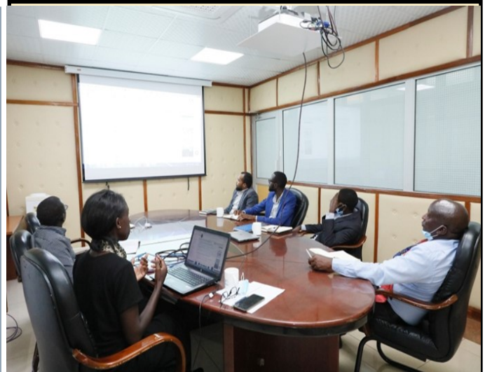
A section of team going through the Resource Centre system demonstration at ORPP 1 st floor boardroom

It contains two main categorisation- general bibliographies of the centre's collection and part of ORPP's institutional repository. In each of the categories, there are various modules for search, users' registration, access control levels, statistics and feedback avenues from the users. The system seeks to enhance efficiency and convenience in access and retrieval of available information, including any manual or digital subscriptions