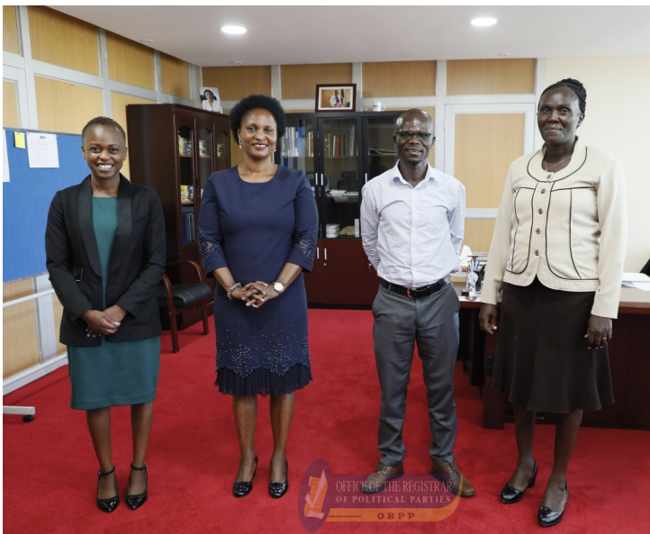
Siasa Place officials during courtesy call to the Registrar

(read more of these fora in next edition)