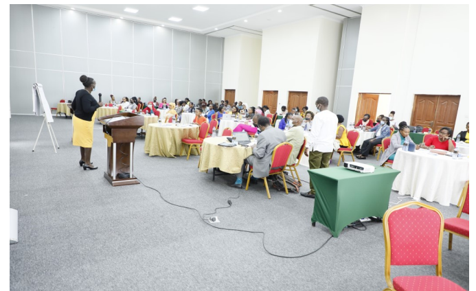
Positioning Young Women Leadership programme conducted by the Office on 20th January 2022 at Semara hotel, Machakos