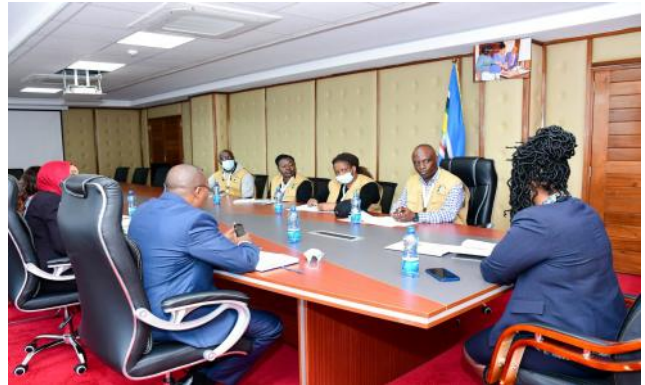
Officials of ZESN hold a discussions with Registrar of Political Parties at ORPP headquarters boardroom.

Discussions held revolved around actions taken by ORPP in preparation for the general election. Some cited were the ongoing countrywide monitoring of Tuesday 9th general election from 6th to 12th August, training of parties' agents; capacity building to party organs, and targeted groups among other initiatives.