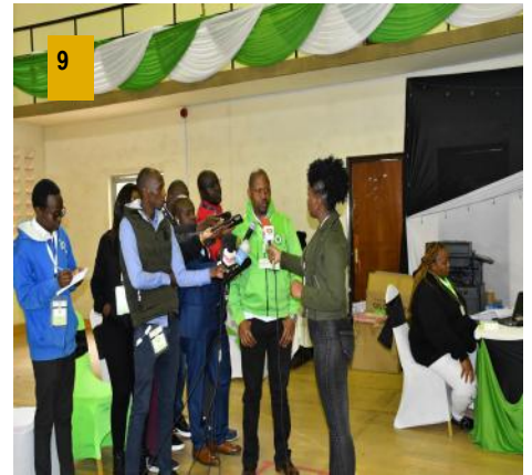
7. Election Observers, Party agents, Aspirants and Election officials await announcement of the results at Kisii tallying centre for Kisii county. 8. Supporters celebrate victory of their aspirant in Aviation tallying centre, Embakasi East. 9. IEBC Nairobi County Returning Officer in a media briefing during the tallying process at Kasarani tallying center.