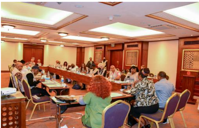
A discussion meeting between officials of Common Wealth Election Observers and senior ORPP officials together with Registrar of Political Parties at Serena hotel conference, Nairobi.