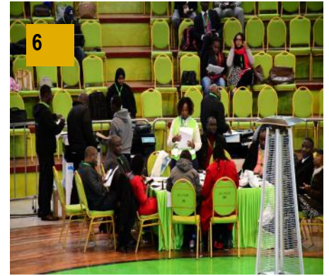
4. Mvita RO receives results from constituency polling stations at Aldina secondary tallying centre. 5. Sealed boxes at Kisumu Central tallying centre. 6. Verification of tallying forms at the National tallying centre by the IEBC officials in Bomas.