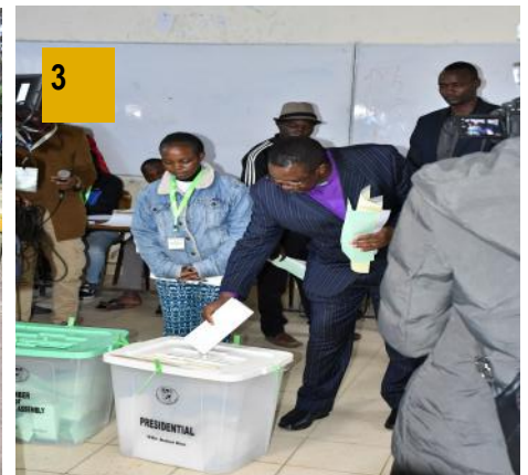
1. ORPP Nairobi based team monitoring elections within Kiambu, Nairobi and Kajiado counties. 2. Kenyans queue to exercise their democratic right as voters on 9th August, 2022. 3. Agano party presidential candidate casts his vote at Upperhill secondary polling station, Kibra constituency.