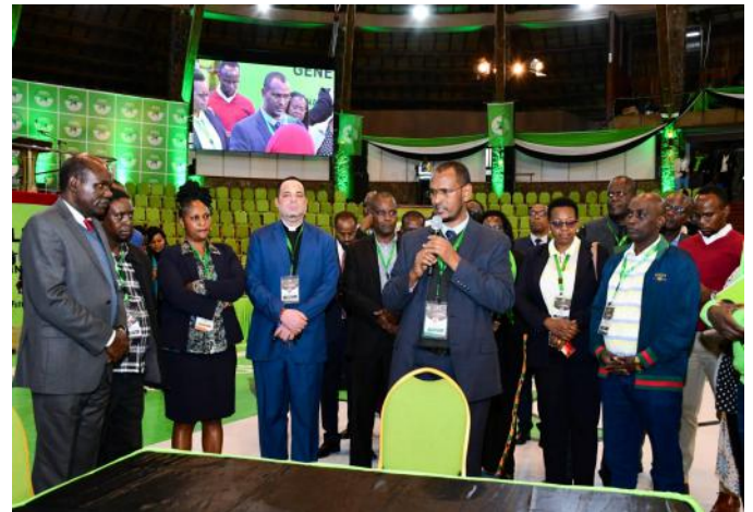
Registrar of Political Parties (third from right) together with Registrar of Political Parties Sudan, IEBC senior officials and political parties representatives at the Bomas of Kenya ahead of the general election.