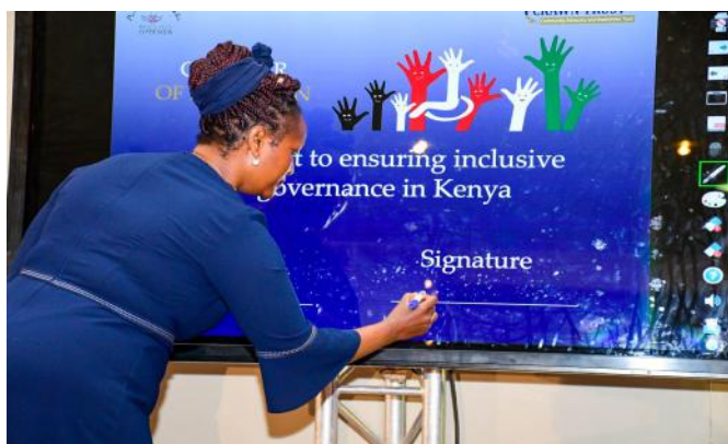
Registrar of Political Parties signs the inclusion Charter document at Desmond Tutu conference center, Westlands Nairobi.

She outlined the affirmative action ORPP had taken to ensure inclusivity such as; ensuring compliance of the 2/3 gender representation in political parties membership and leadership; Amendments of the Political Parties Act especially section 25 which expands the eligibility of Political Parties to qualify for Political Parties Fund based on the number of Special Interests Groups among others.