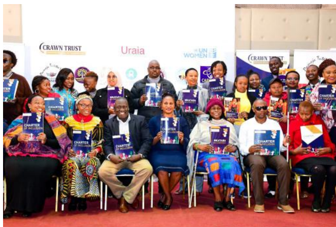
Officials of CRAWN Trust together with Registrar of Political Parties (Centre) in a group photo at Desmond Tutu conference centre on 2nd August, 2022

The overall goal of the Charter was to contribute to the building of a just, inclusive and democratic society, founded on an informed and empowered citizenry. In her part,