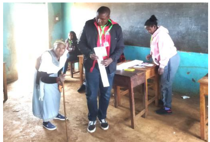
Some of the voters being guided on procedure of voting Pokot West constituencies and Nyaki West ward of Imenti North, Meru County

In the contest, political parties candidates carried the day with only one independent candidate clinching an MCA seat in Kwa Njenga ward of Embakasi South Constituency.