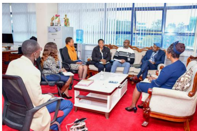
Regional International Government Organization pay a courtesy call to the Registrar of Political Parties in her office on 3rd August, 2022