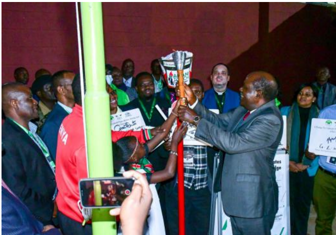
IEBC chairman, Wafula Chebukati lights up the 'Olympic touch' as a gesture of peaceful free and fair conduct ahead of the general elections on the 8th August at the Bomas of Kenya.